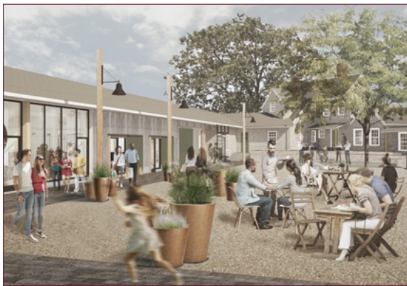
Rendering of the small-format retail spaces from within The Speedway courtyard.

If you have any questions or comments, please email our team at hello@charlesriverspeedway.com .